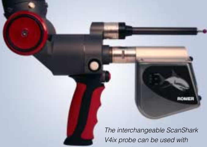
The interchangeable ScanShark V4ix probe can be used with Brown & Sharpe bridge-type CMMs.